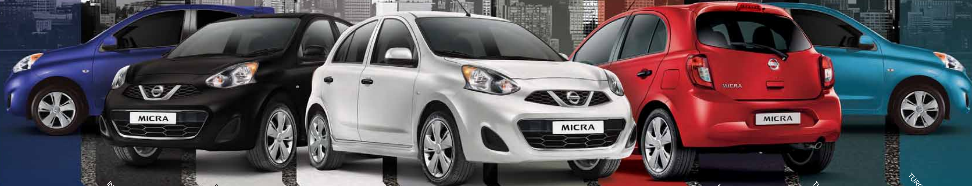
BLUE B53 (M)